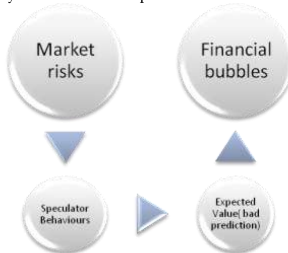
Fig. 2. Causal connection between all variables

Thus, the prediction of advance information on market risk allows the preparation of the action plan of the Tunisian State. It guides him in which direction it must maintain the relative change in both nominal exchange rate to the market and therefore the pressure indicator and the price earnings ratio. This prevents accumulation of financial bubbles. In fact a financial crisis is usually caused by high variation in the exchange rate. There is a unidirectional causality between market risk and the EPM, which confirms the interaction between the real economy and the financial sphere.